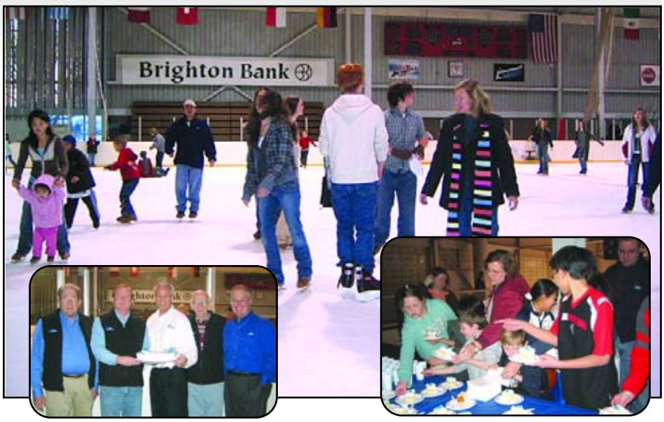
(Above) Skaters included the free ice time at the Cottonwood Heights Rec Center during the city's second birthday celebration.