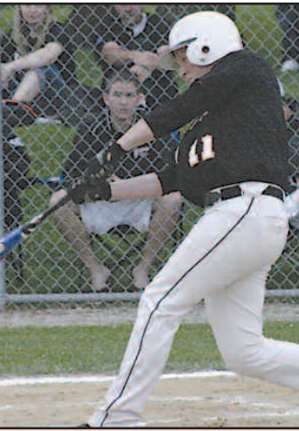
SPORTS ACTION! Pages 1B-2B