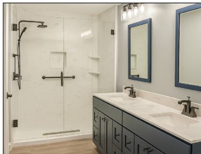
FULL BATHROOM REMODELS