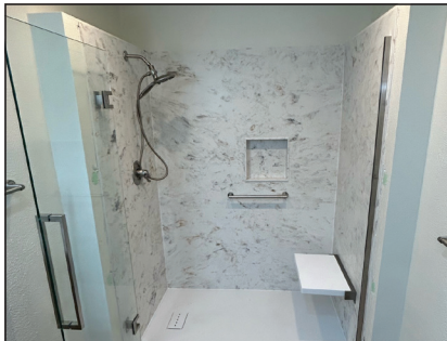
TUB TO SHOWER CONVERSIONS