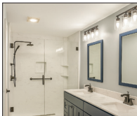
FULL BATHROOM REMODELS