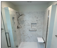
TUB TO SHOWER CONVERSIONS