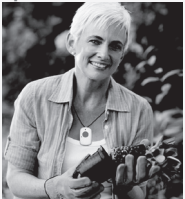
The automatic fall detect pendant that works WHERE YOU GO!